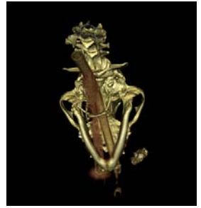
3D Image of the Skull

Thursday, April 28<sup>th</sup> Registration 6:00-6:30pm Dinner 6:30-7pm Lecture 7pm